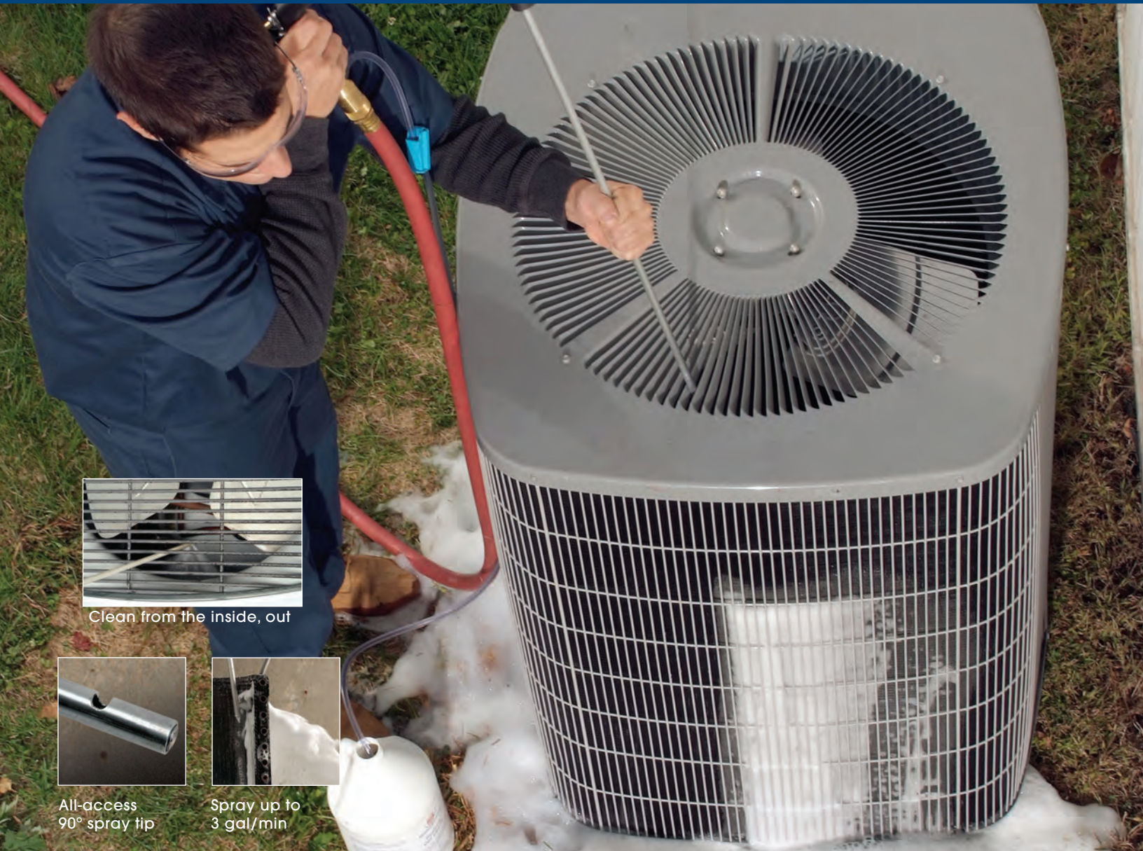
Clean from the inside, out