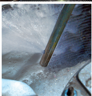
Easy cleaning in any situation