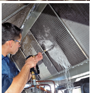
Fine or wide spray

The FlowJet connects to a water source to deliver a continuous spray of water and cleaning chemical to wash even the dirtiest coils, without damaging sensitive fins. And the optional Wonder Wand lets you clean coils from the inside out – a proven method for increasing coil cleaning and system efficiency. Now that's smart.