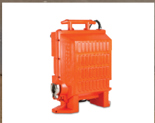
Small, portable, powerful