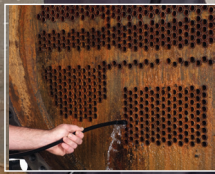
Fits a variety of tubes